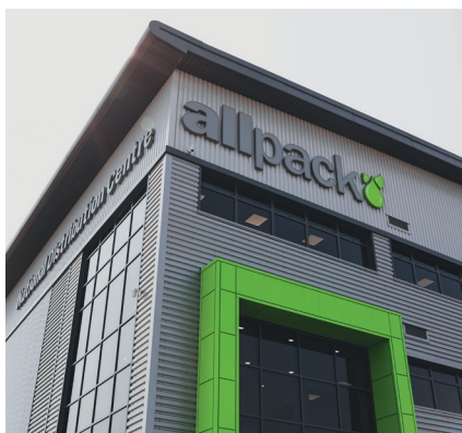
Allpack Cannock NDC