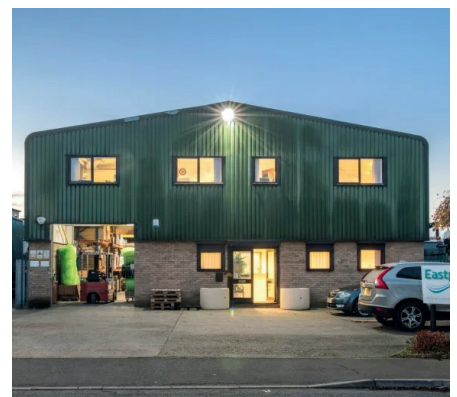
Allpack Peterborough NDC