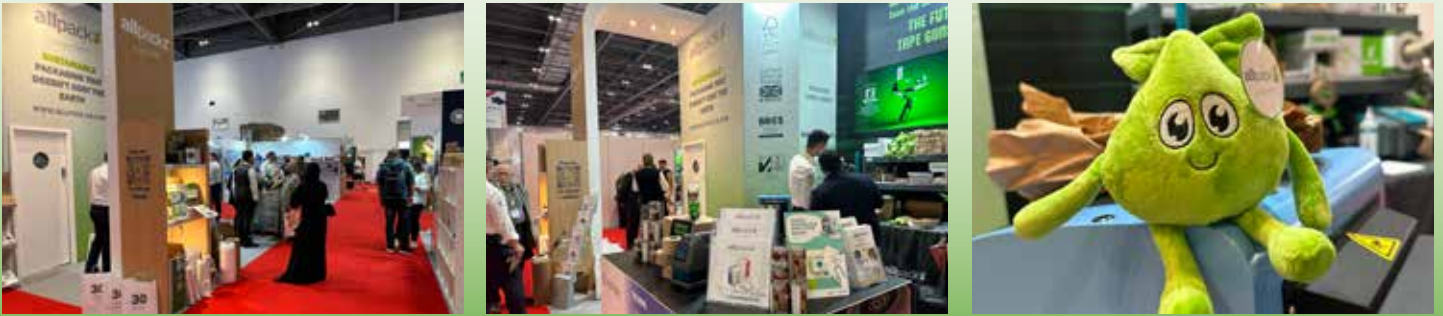
Photos of the Allpack Exhibition Stand at London Packaging Week 2024

Allpack looks forward to exhibiting at the 2025 London Packaging Week event, being held 15-16 October 2025, ExCel, London.