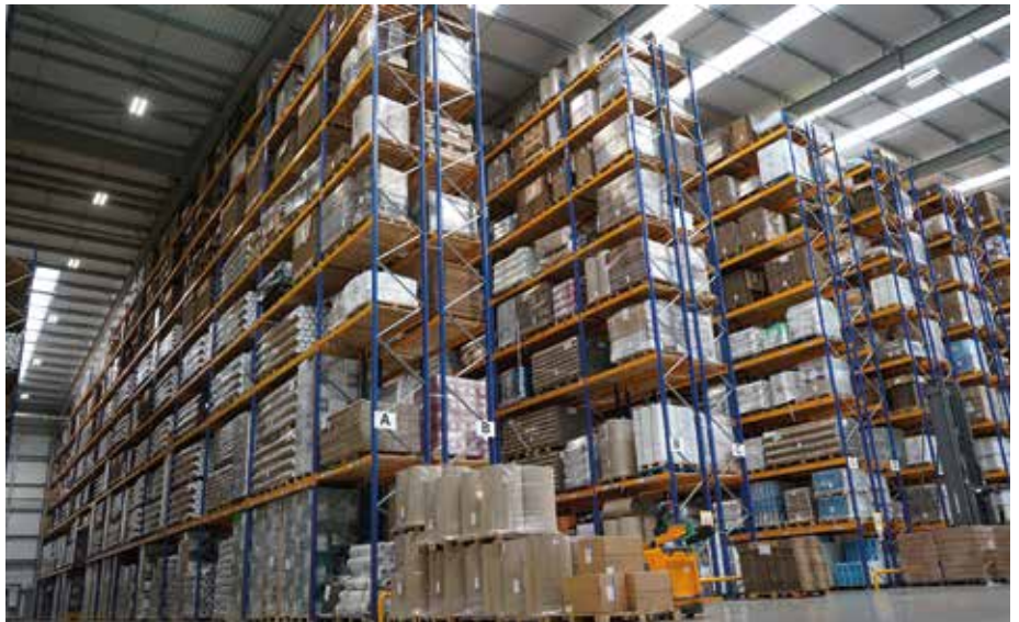
Allpack's Certification Update