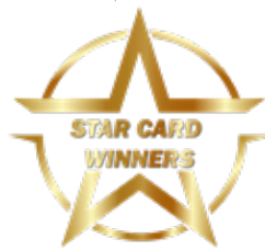
Over the previous quarter, Allpack recognised the achievements of the following staff members.